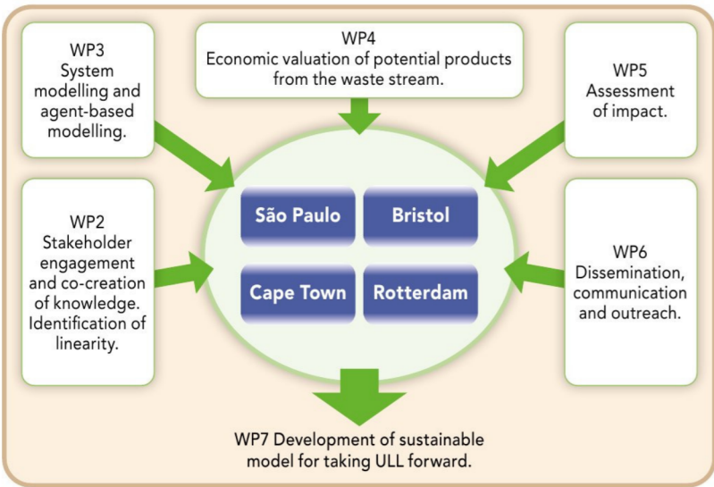
The WASTE FEW ULL project: WP1 Project management and coordination.

According to the United Nations, 55% of the world’s population now lives in cities, a figure projected to increase to 68% in less than 30 years, and the urban standard of living is increasing with associated increases in consumption. The Earth’s finite resources will not be able to cater to the food production, energy generation, and water provision required to support for such expansion – environmentally, socially or, ultimately, economically – without substantial structural and systemic shifts.