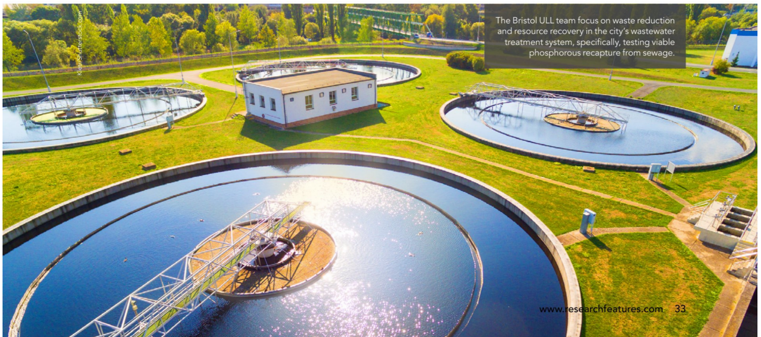
The Bristol ULL team focus on waste reduction and resource recovery in the city's wastewater treatment system, specifically, testing viable phosphorous recapture from sewage.

operates the city's sewage infrastructure and a major waste processing plant. As the project developed, these three were joined by Bristol Waste, the council-owned company that manages the city's waste processing, and Resource Futures, a locally based, national non-profit consultancy focused on waste reduction. The ULL was co-led by two intermediary agencies: Daniel Black & Associates (db+a) and The Schumacher Institute – alongside the Consortium Lead, University of Coventry, which provided expertise in food, water, and resilience. They were supported by the universities of Bath