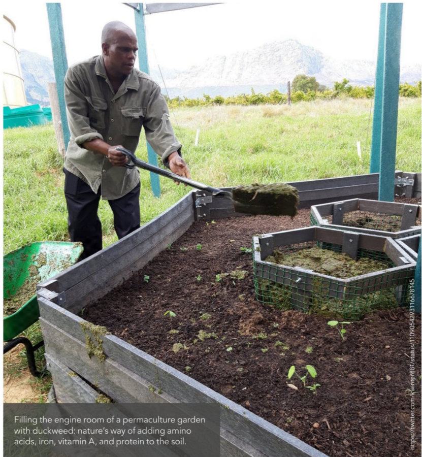
Filling the engine room of a permaculture garden with duckweed: nature's way of adding amino acids, iron, vitamin A, and protein to the soil.

Langrug is one of the thousands of informal settlements that surround developed urban hubs worldwide. As climate change impacts undeveloped and developing nations more heavily, and their citizens flock to urban areas looking for solace and hope, those settlements will grow. Therefore, a model